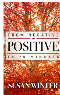
From Negative to Positive in 20 Minutes